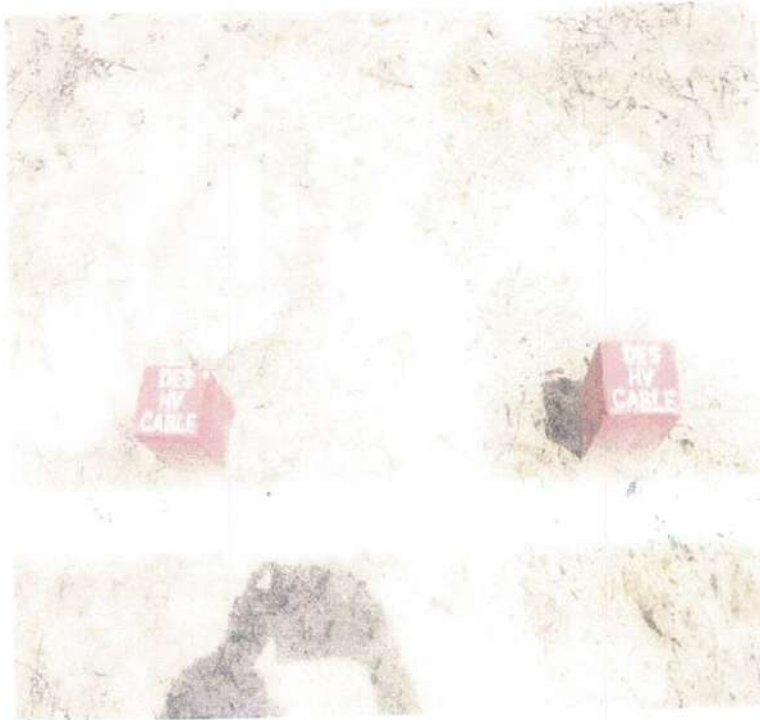
INDICATOR POST FOR DES HV CABLE - PHOTO 1