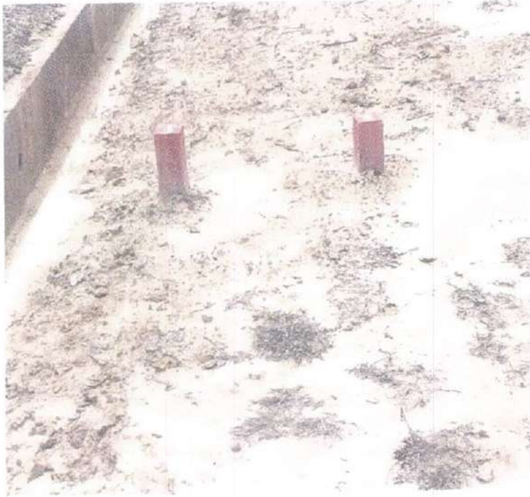
INDICATOR POST FOR DES HV CABLE - PHOTO 2