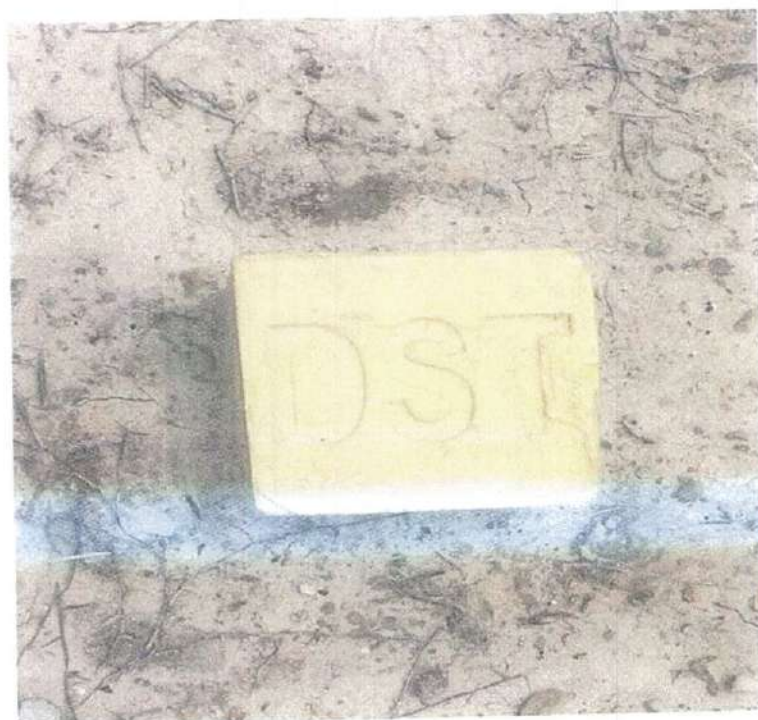
INDICATOR POST FOR DST