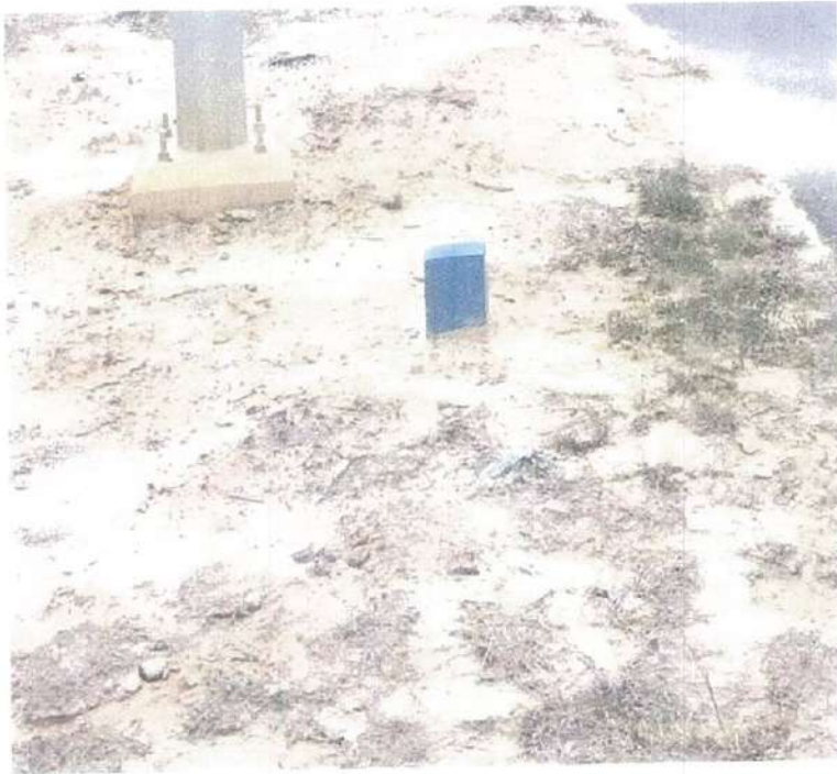
INDICATOR POST FOR WATER