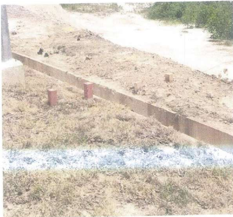
INDICATOR POST FOR DES HV CABLE - PHOTO 3